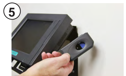
5 Remove Biometric ID Pad Attach the replacement ID Pad by reversing the steps above.