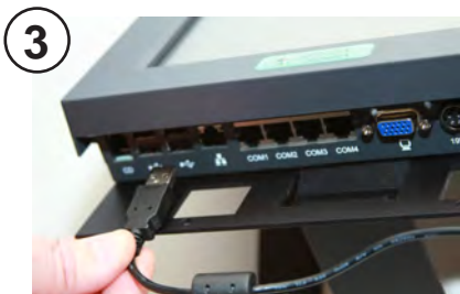
3 Unplug the USB connection for the Biometric ID Pad