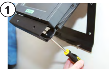
1 Remove 2 screws securing the Cord Guard