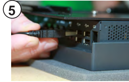
5 Unplug the USB connection for the Biometric ID Pad