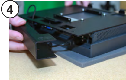
4 Remove Cord Guard to gain access to USB connection for the Biometric ID Pad