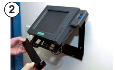
2 Remove Cord Guard to gain access to USB connection for the Biometric ID Pad