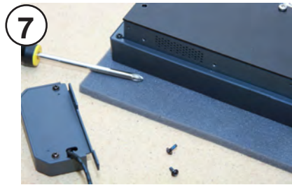
7 Remove Biometric ID Pad Attach the replacement ID Pad by reversing the steps above.