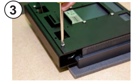
3 Place the PC face down on a protected/padded surface. Remove 2 screws securing the Cord Guard