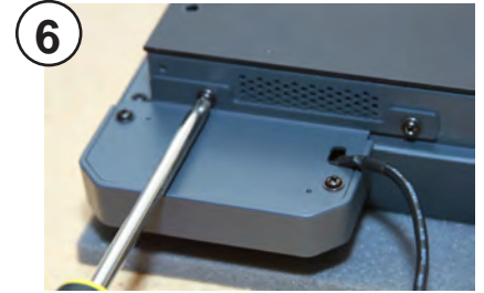
6 Remove 2 screws connecting the Biometric ID Pad to the PC