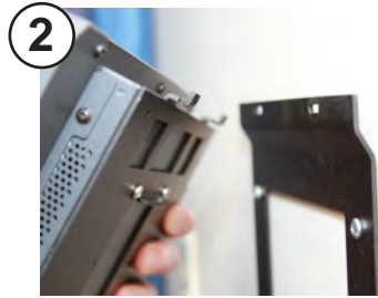
2 Lift the PC and remove from Base Mount