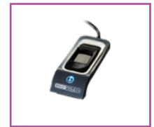
Biometric ID Pad Fingerprint Reader