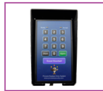
Keyless Entry System