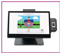
The Procure Touch