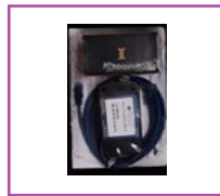
Interior Door Controller