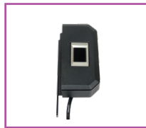
Replacement Sidemount Fingerprint Reader