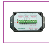
Keyless Entry Relay Box